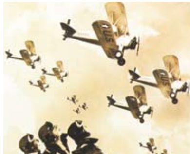
Already in use during the second World War: the US - Military Standard 105-D

Today's AQL has developed over the years, from this test method.