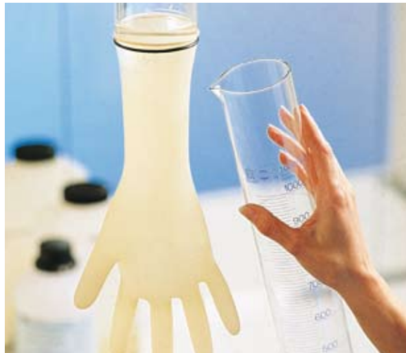
Water retention test

Air testing, another test during which the glove is blown up at a defined pressure and checked for perforation is however a non-destructive test procedure and can therefore be used for the entire production quantity. It must however